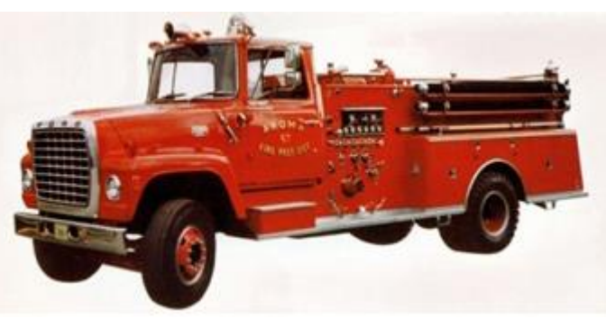
Almost the prototype